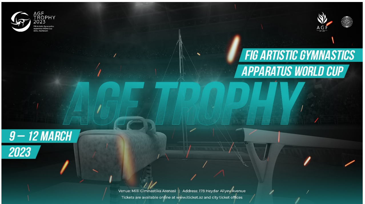
FIG ARTISTIC GYMNASTICS APPARATUS WORLD CUP AGF TROPHY March 9-12, 2023