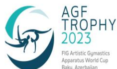
FIG Artistic Gymnastics Apparatus World Cup AGF Trophy Baku, Azerbaijan March 9-12, 2023