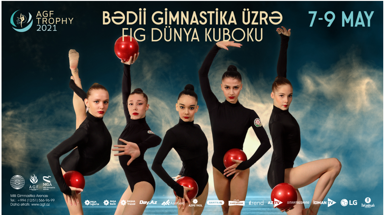
FIG RHYTHMIC GYMNASTICS WORLD CUP AGF TROPHY