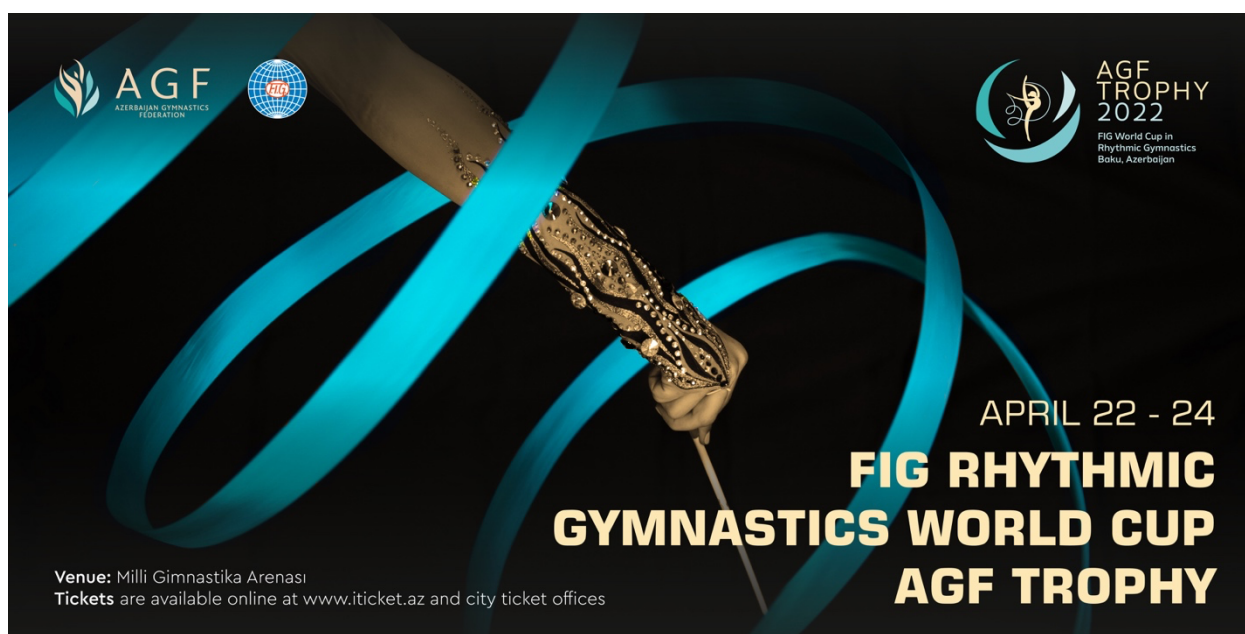
FIG RHYTHMIC GYMNASTICS WORLD CUP AGF TROPHY