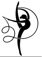
FIG RHYTHMIC GYMNASTICS WORLD CUP AGF TROPHY Rhythmic Gymnastics Qualification Group SENIORS

AGF TROPHY 2024 FIG World Cup in Rhythmic Gymnastics Baku, Azerbaijan