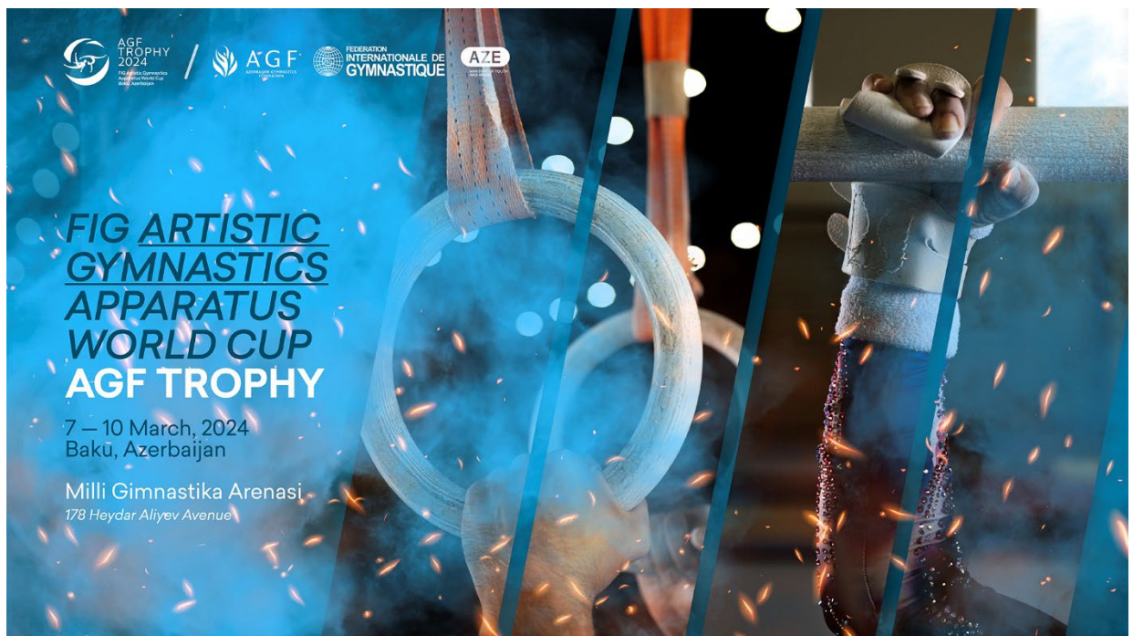
FIG ARTISTIC GYMNASTICS APPARATUS WORLD CUP AGF TROPHY March 7-10, 2024