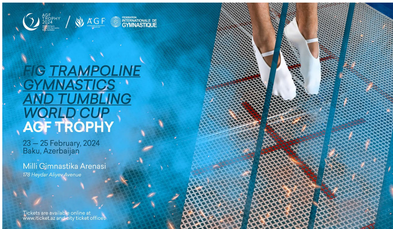
FIG TRAMPOLINE GYMNASTICS & TUMBLING WORLD CUP / AGF TROPHY