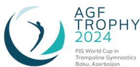
FIG TRAMPOLINE GYMNASTICS WORLD CUP AGF TROPHY FEBRUARY 23-25, 2024 BAKU, AZERBAIJAN