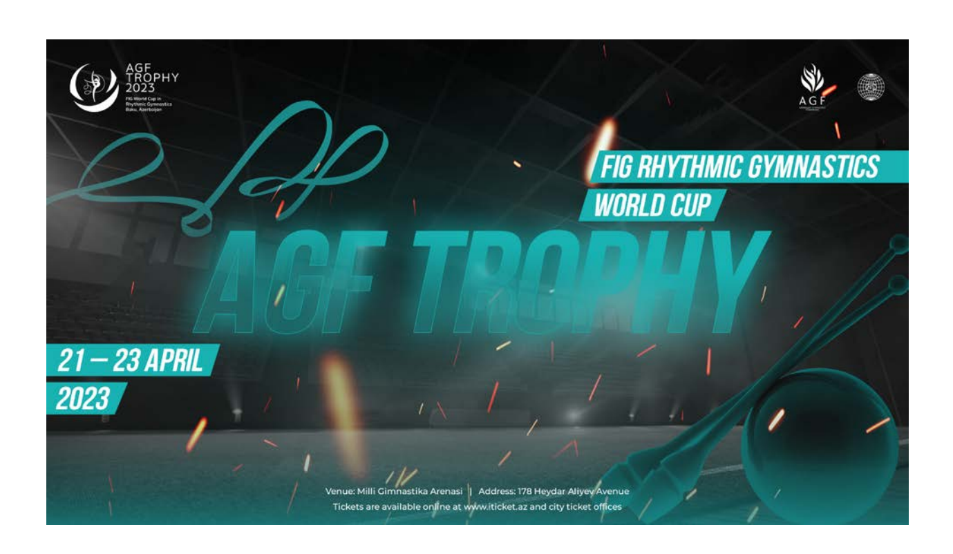
FIG RHYTHMIC GYMNASTICS WORLD CUP AGF TROPHY