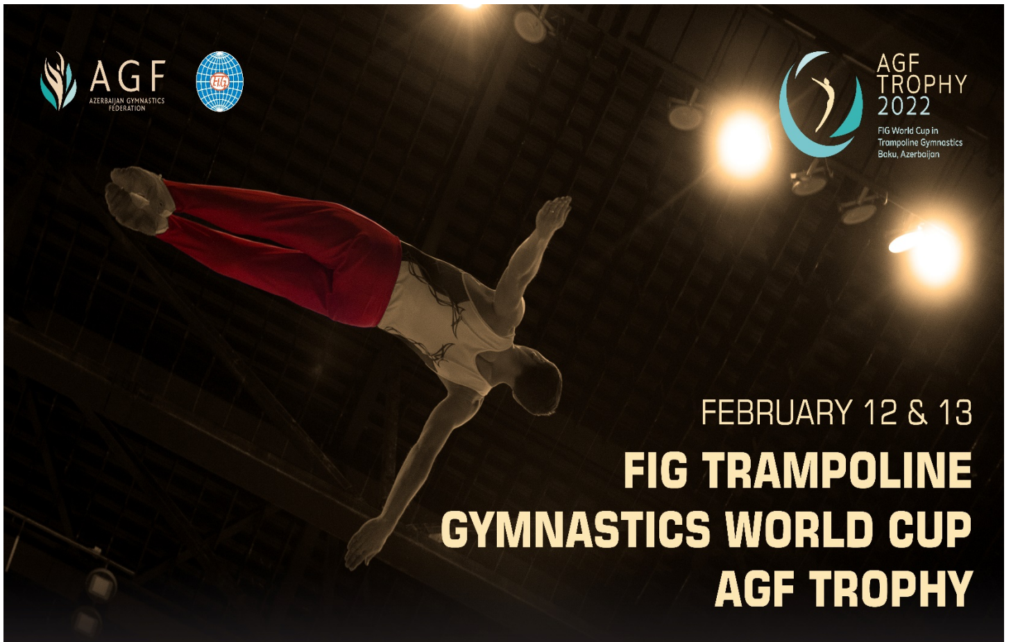
FIG TRAMPOLINE GYMNASTICS WORLD CUP / AGF TROPHY