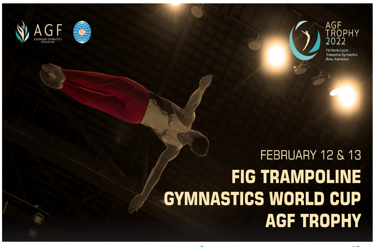
FIG TRAMPOLINE GYMNASTICS WORLD CUP / AGF TROPHY