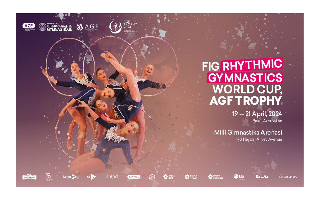
FIG RHYTHMIC GYMNASTICS WORLD CUP AGF TROPHY