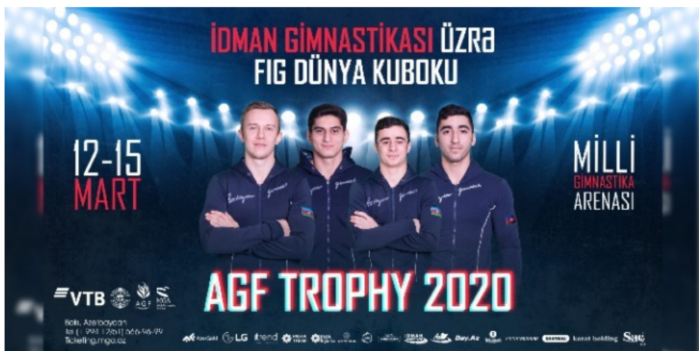
FIG ARTISTIC GYMNASTICS INDIVIDUAL APPARATUS WORLD CUP AGF TROPHY March 12-15, 2020